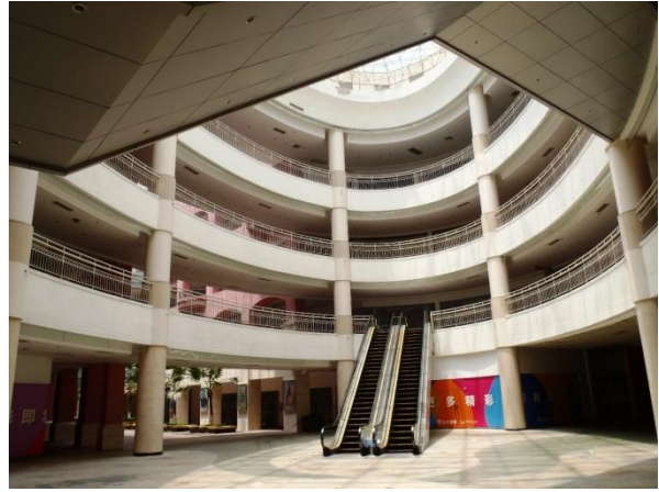
Left: Five F-35's under construction, estimated cost 1.52 billion USD. Right: The New South China Mall, the world's largest mall sits unoccupied. While the final cost of the mall is still unknown, we do know it would cost nearly twice as much to crash a single F-35 as it would to bail-out the developer's outstanding loan of ~154 million USD from Agricultural Bank of China.

While we obviously shouldn't brandy around the word "bubble," as investors we need to evaluate industry supply and demand and be particularly mindful to avoid gluts of inventory and overbuilt capacity. Both conditions tend to result in very poor investment returns. In my view, the U.S. military appears to be nearing the end of period of peak demand. The defense sector outperformed the broad market significantly during the 2000's on the back of seemingly endless government credit and multiple foreign wars. The frenzy is now winding down. The wars are being halted and the U.S. Treasury doesn't have much treasure left to burn. Some of the order backlog touted by defense contractors (Lockheed Martin Corp. reports an order backlog almost 2.5 times its current market capitalization) could well turn out to be "ghost backlog." Additionally, the fact that sizable defense cuts were built into the original sequestration shows that beltway insiders are aware that weapons spending has gotten out of hand. Be assured the subject will be back on the radar come February's debt-ceiling discussions. You don't need to take my word for it. Industry insiders are best aware of the risk: